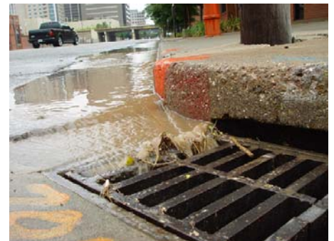
ACOG communities will have to implement Phase II stormwater rules once the general permit is issued.

ACOG is also awaiting authorization to implement a regional stormwater public education program, which is one of the six minimum control measures required by the permit. The regional approach of the program will assist communities that may not have the time or resources to implement an effective program of their own. The program is being offered free to affected ACOG communities. More details will be provided in coming months. For more information on the stormwater permit process, contact John Harrington, ACOG.